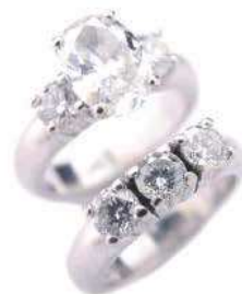
Diamond, Platinum Wedding Ring Set Sold for $11,210

www.michaans.com • Ph: (510) 740-0220 Main Gallery: 2751 Todd Street, Alameda, CA 94501